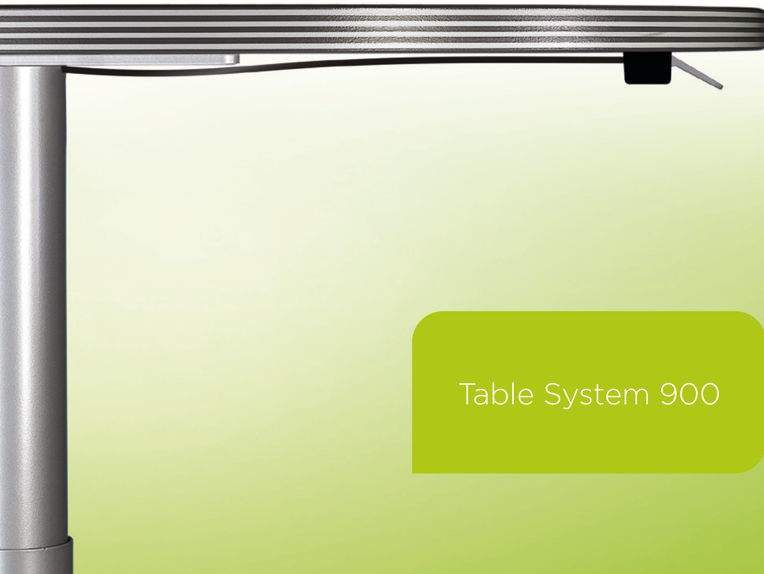
Table System 900