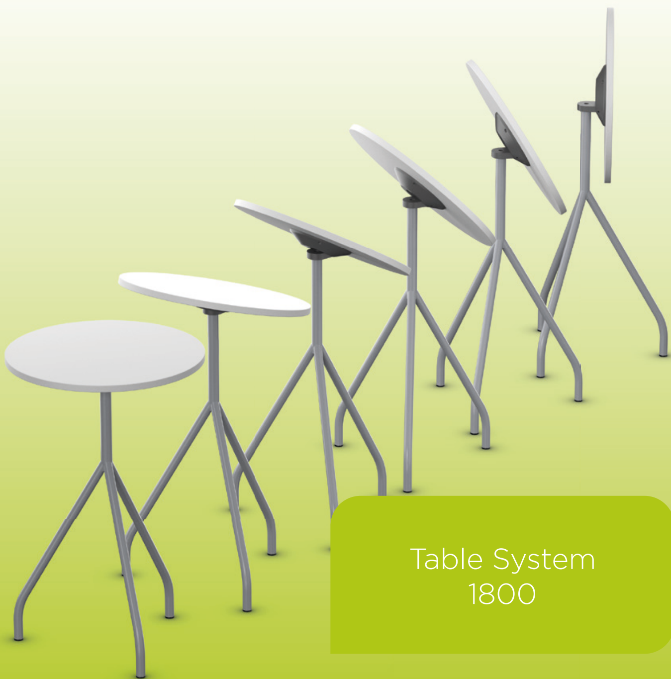
Table System 1800